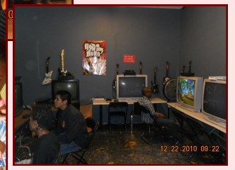
Pine Manor's Teen Hope enjoys night out at the Bridge